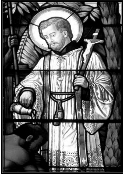
St. Francis Xavier

Family Mass Sunday March 1 @ 10.30am All Welcome!! Music, Song, Story, and Drama in the Presence of Jesus. This is a really good experience of Mass for families/young children.