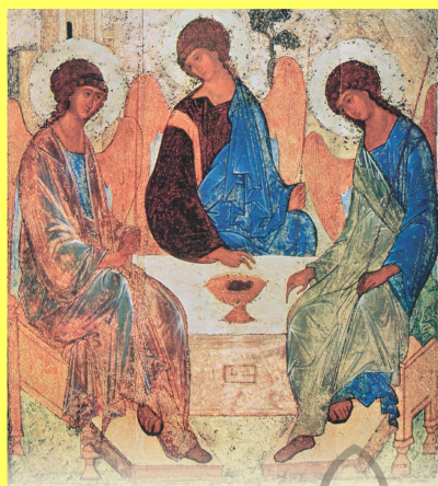
Most Holy Trinity