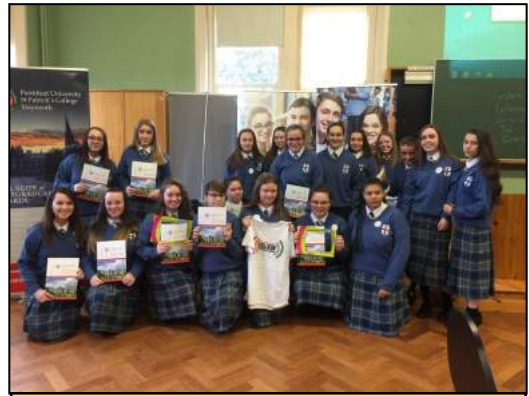
TY Trip to Maynooth for College Awareness Week